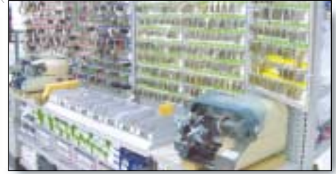
Key Cutting Area -Provide instant service to areas that need a specialist.