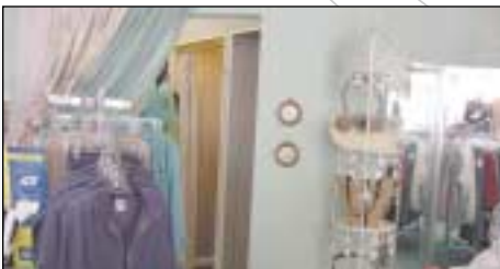
Fitting Rooms -Provide instant service and added convenience so that associate can retrieve a different size or color garment for the customer.