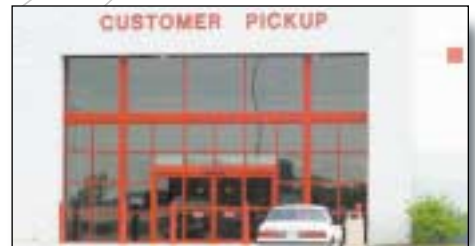
Customer Pick-Up/Will-Call Areas -Enable quick service after the sale.