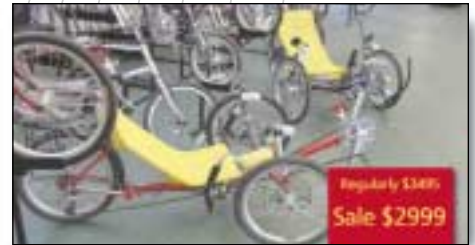
Point-of-Purchase Displays -Manufacturers can include the Quick Assist with P.O.P. promotions. Promote a sale item or special buy.