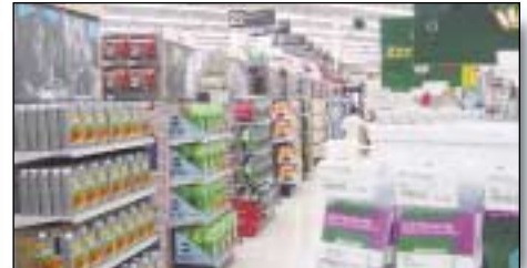
Provide service to areas that are temporarily unstaffed.