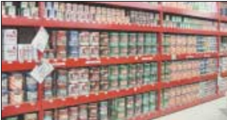
Paint Department -Instant assistance in areas that need a professional.