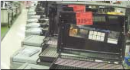
Grills -Allows customers to call the category "expert".