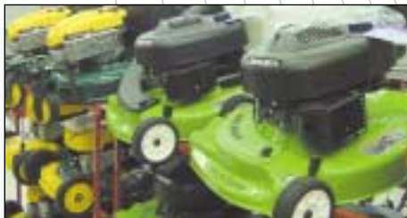
Lawn Mowers -Promote high ticket items, improve sales and productivity—allows customer to call the category "expert".